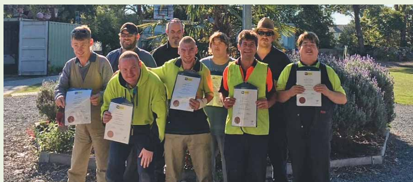
The Farm Graduates

The My Life, My Future graduation was attended by the students' families, who enjoyed afternoon tea together afterwards.