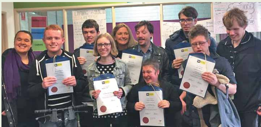
My Life, My Future Graduates

We have continued to conduct graduations as the Certificates have been issued from Box Hill Institute. The participants from the Farm enjoyed receiving their awards and the afternoon tea provided.