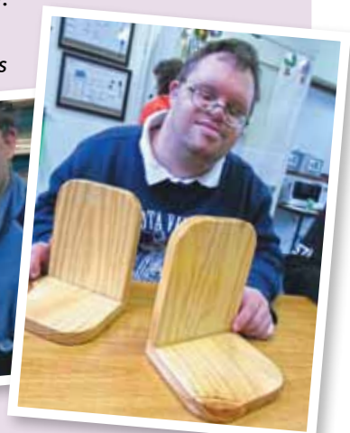
The End Product